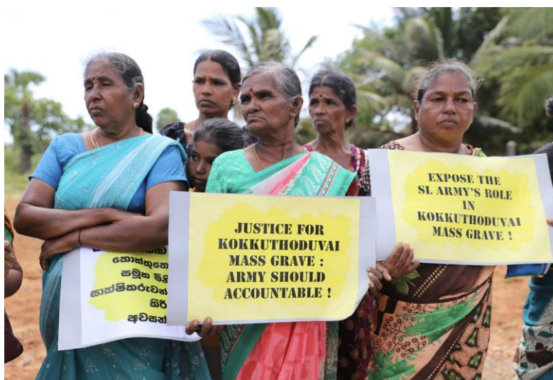
On 30th August, Tamil families of the disappeared marked the International Day of the enforced disappearances by organizing various protests across the North and East, demanding justice, accountability, and international investigations.