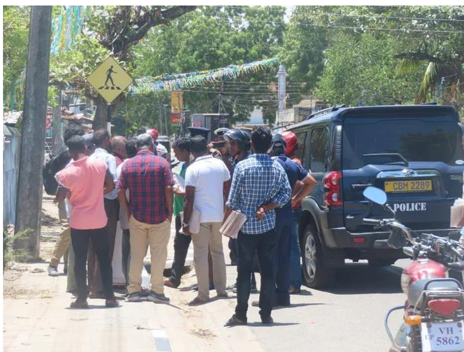
Police ordered not to distribute any leaflets with messages asking not to vote, as it is unconstitutional and prohibited.