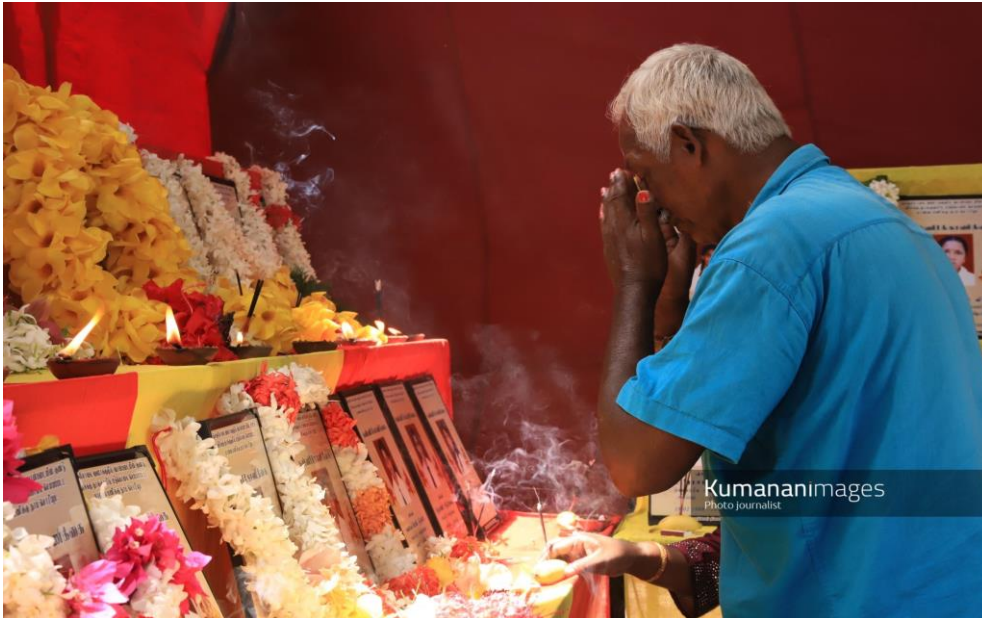
Sri Lankan Air Force bombed the Sencholai school premises, resulting in the deaths of 53 Tamil schoolgirls and 8 staff members.