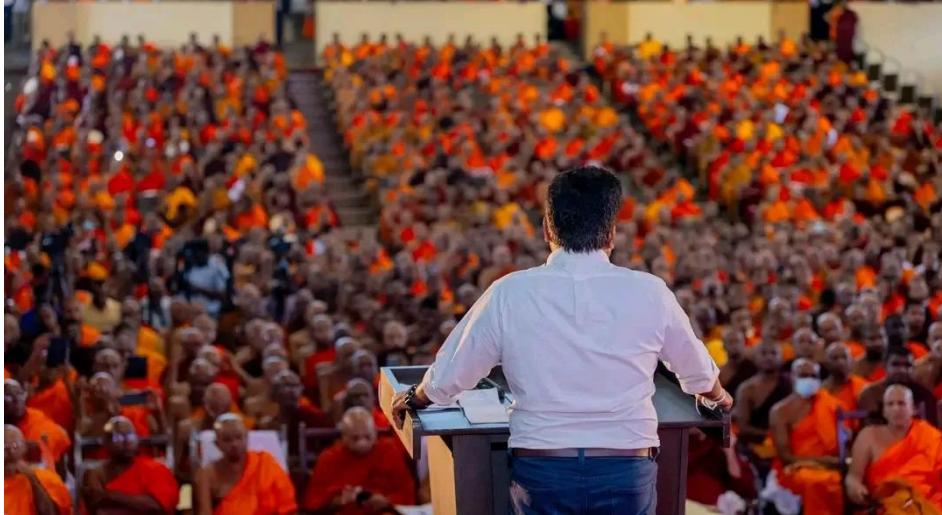
Dissanayake made this statement at the 'Sangaruvane Maha Pelahara', a convention of the Bhikkus organised by the National Bhikku Peramuna at the Maharagama Youth Center Auditorium, located in Colombo suburbs.