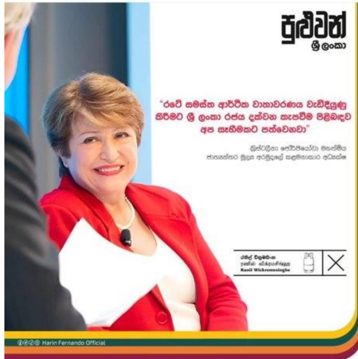
Managing Director of the International Monetary Fund, Kristalina Georgieva's image and statements have been used in the campaign materials of the incumbent President Ranil Wickremesinghe