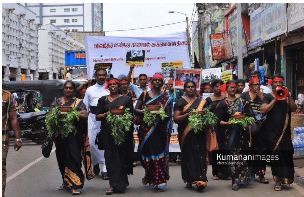
Mothers of family members who were forcibly disappeared marching in protest and calling for Justice. Photo

Mothers from the Tamil community in Vanni, who symbolise the victims of enforced disappearances, conveyed a powerful message by firmly disassociating themselves from the upcoming presidential election in Sri Lanka, asserting that none of the Sinhala candidates could be relied upon to provide justice (Lanka Files, 2024).