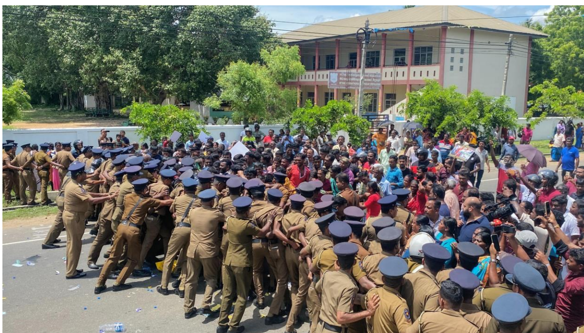
Using disproportionate force, on 8th October, Police dispersed the protest organised by cattle farmers and other activists in Batticaloa.