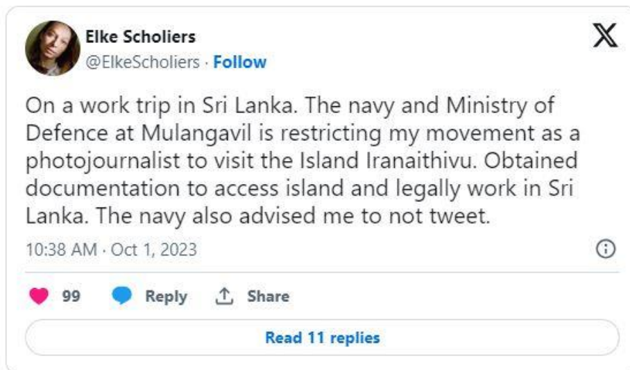
Tweet by the Photojournalist denied entry to the Iranai Theevu Island in the Northern Province.

Repression of Media and Journalists: An international photojournalist was refused entry to the Iranai Theevu Island by the Sri Lankan military. Four journalists including the head of the news section at Neth FM had been summoned and questioned by the Parliamentary Privilege Committee, over a complaint made by a government Minister. Management of the State owned press company Associated Newspapers of Ceylon Limited (ANCL) launched a disciplinary inquiry against an editor of one of its daily newspapers, for quoting a statement made by the Opposition leader criticising the President. 8 Two Tamil journalists in Batticaloa were questioned by the Police for over 2 hours, in relation to their reporting on Police violence occurred while dispersing protest organised by cattle farmers.