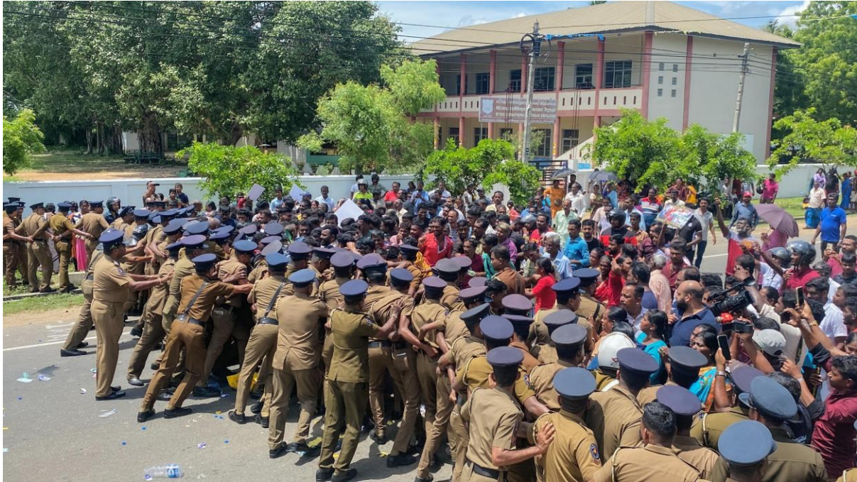
Using disproportionate force, on 8th October, Police dispersed the protest organised by cattle farmers and other activists in Batticaloa.

District Ampara who were planning to join the protest in solidarity were stopped in Batticaloa and questioned for around 3 hours, in order to prevent them from joining the protest. Police fired tear gas at a protest held in Colombo, by several teachers trade unions, and two other protests organised by university students in Kandy and Colombo.