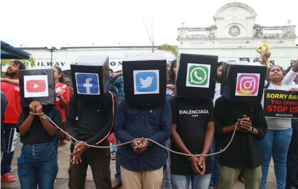
A protest against the online safety bill was held in Colombo, on 26th September.

A group of 125 civil society leaders and 37 organisations and collectives also issued a statement demanding the government to withdraw both Online Safety Act (OSA) and Anti Terrorism Act (ATA) which seriously curtail and even violate the freedoms of expression, free speech, right to information, assembly and association and threaten democracy and fundamental rights. 33 Centre for policy alternatives released a separate statement on OSA, 34 and a commentary on Anti Terrorism Act 35 requesting the government to withdraw these proposed repressive legislations. On 13th of October, the Office of the High Commissioner for Human Rights also issued another statement raising serious concerns over the two bills.