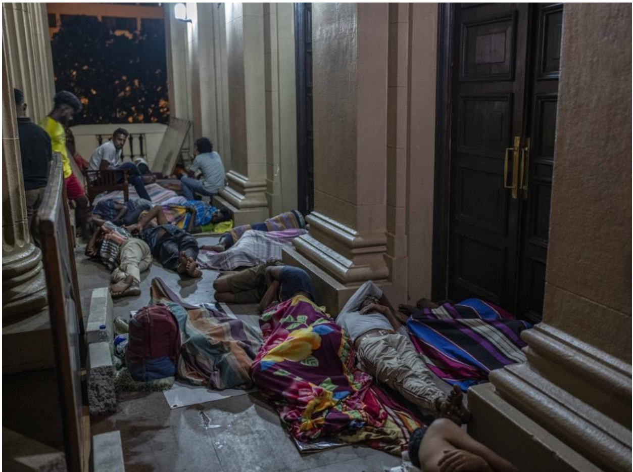
The protestors who were sleeping at the Presidential Secretariat, just before they were assaulted by the military in the early morning of 22nd July.