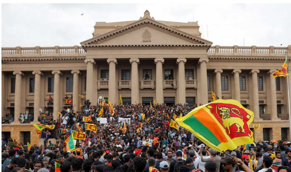
Demonstrators protest inside the Presidential Secretariat premises, after President Gotabaya Rajapaksa fled. July 9, 2022.

Economic Crisis: Continuing trend of higher inflation was reported the same as the previous months, contributing to hunger, lack of nutrition and other issues. Food inflation (Y-o-Y) increased to 90.9% in July 2022 from 80.1% in June 2022, while Non-Food inflation (Y-o-Y) increased to 46.5% in July 2022 from 42.4% in June 2022. 1 According to a survey done by Save the Children Sri Lanka, 85% of households have reported a loss of income since the economic crisis, while 58% have reported losing more than half of their income, and 11% losing all their income. Around 74% of households have reported changing their food habits during the economic crisis, including 40% having reduced the portion of the meal, and 30% having reduced the number of meals. 2