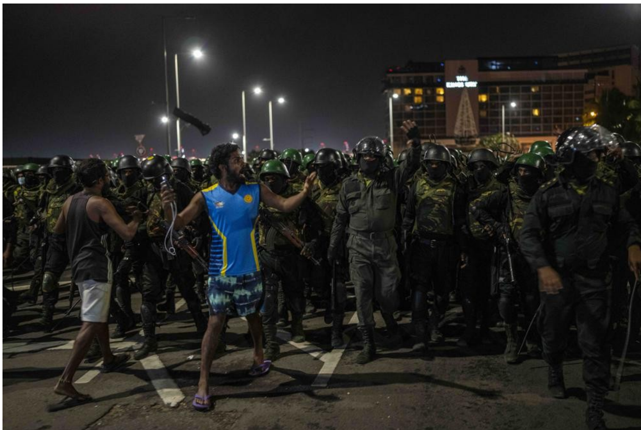
Army soldiers assaulted the protestors and forcibly removed them and their tents from the protest camp outside the Presidential Secretariat, on July 22, 2022.