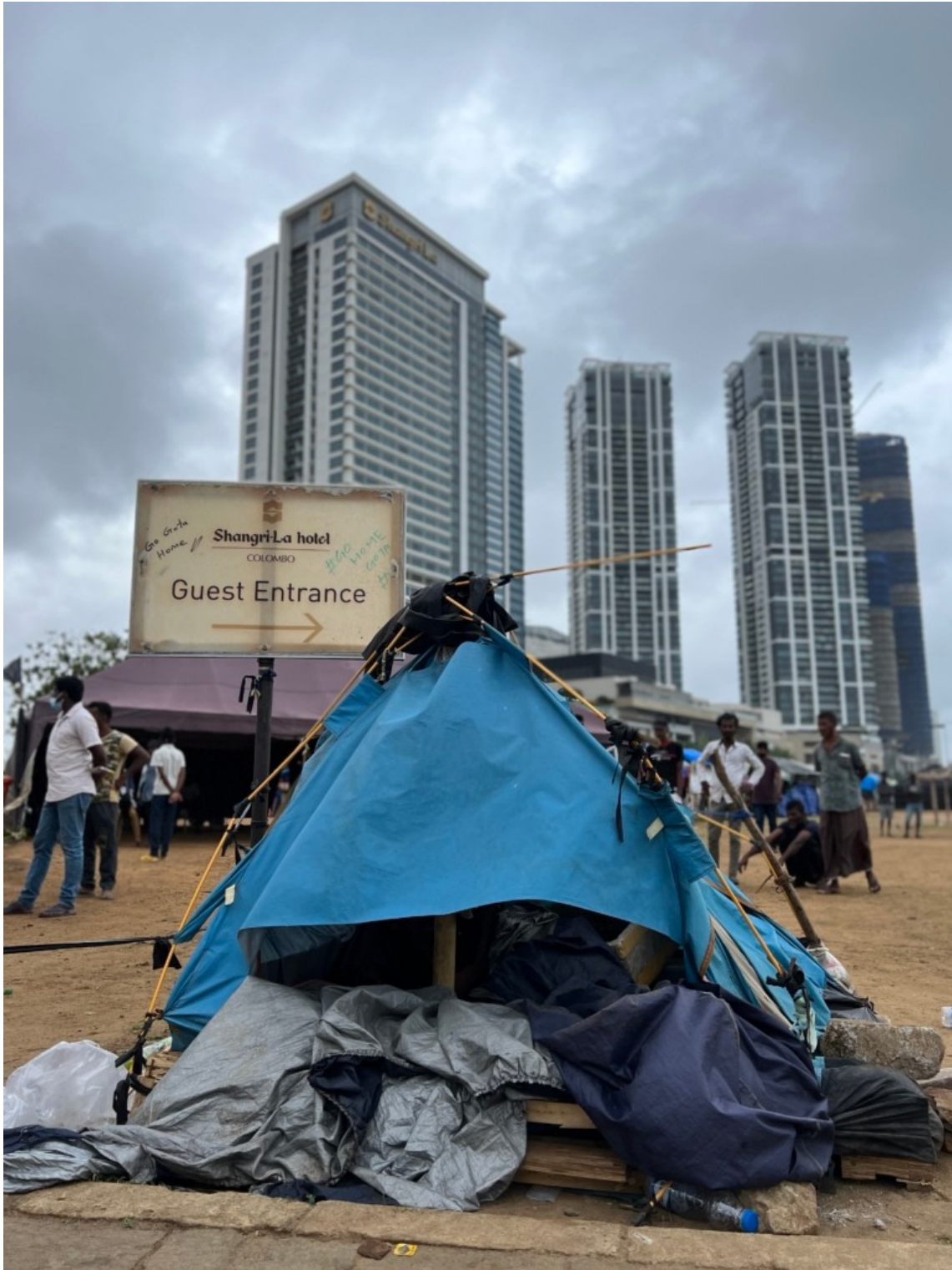
A broken tent at the GotaGoGama protest site after the attack on peaceful protestors on 22nd July.