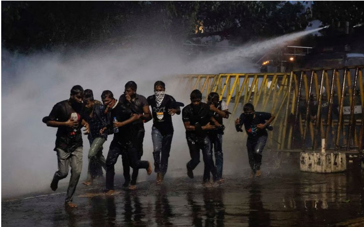
IUSF protesters being attacked by water cannons by the Police.