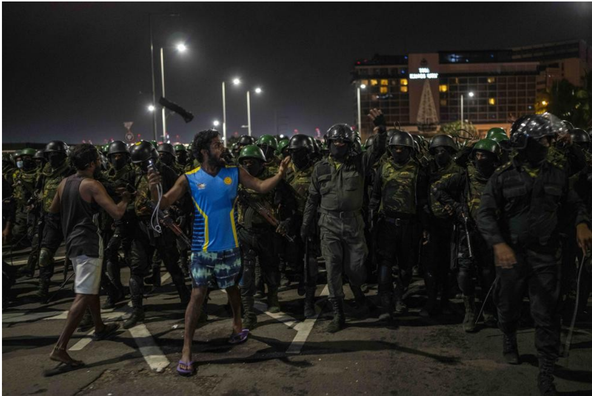
Army soldiers assaulted the protestors and forcibly removed them and their tents from the protest camp outside the Presidential Secretariat, on July 22, 2022.