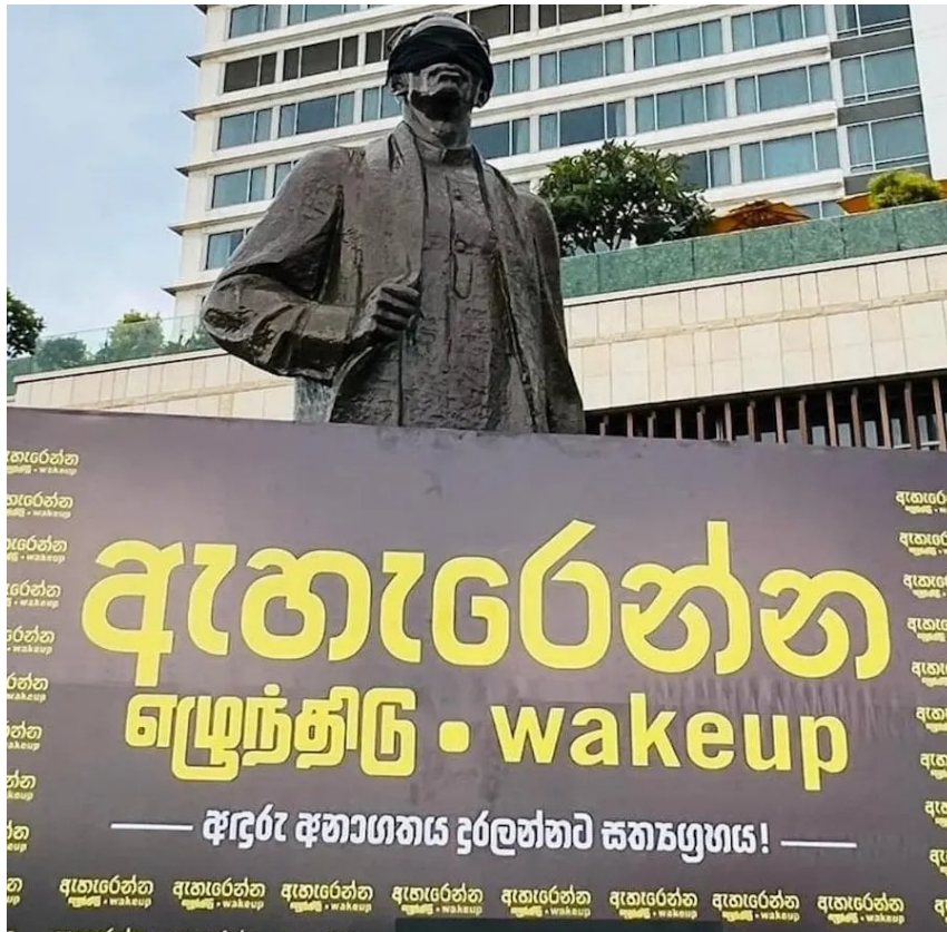
The blindfolded Bandaranaike statue in the protest site.

Based on a submission made by the Fort Police station about reports on impending damages to the SWRD Bandaranaike statue in the Galle Face protest site, Colombo Fort magistrate issued an order preventing protestors from gathering around 50 metres radius from the statue. On 22 nd April, Tamil Guardian website published an article titled “ Why Sri Lanka’s protestors must topple the statue of Bandaranaike in Colombo ,” a protestor blindfolded the statue around a week later. 32 In early May, Sri Lanka Freedom Party requested the Inspector General of Police to probe into the incident of blindfolding the statue. SWRD Bandaranaike (1899-1956) was the 4 th Prime Minister of Sri Lanka who was assassinated by a Buddhist monk in 1956. He is also the founder of Sri Lanka Freedom Party, and reviver of Sinhala nationalism in Sri Lankan politics. He is also blamed for introducing the “Sinhala Only Act” that led to strong divisions between Sinhala and Tamil ethnic groups. Sinhala nationalist mob attacks targeting minority Tamils in Sri Lanka were heightened in the 1980s, almost two decades after his death, leading to a three decades long civil war. On 20 th July 2022, the Colombo Fort Magistrate Thilina Gamage issued an