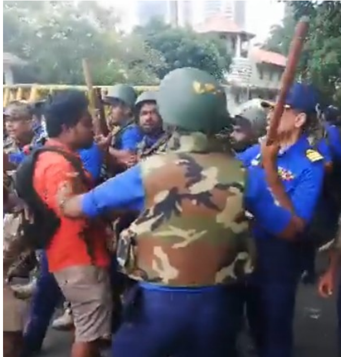
Military using batons to disperse protesters.