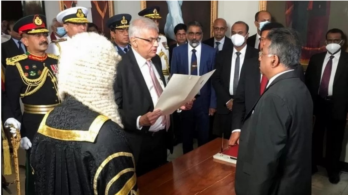
Ranil Wickremesinghe was sworn in as the new president of Sri Lanka by the Chief Justice in parliament.

Wickremasinghe remained in power, despite him initially expressing willingness to resign from his position in order to establish an all-party government. 6