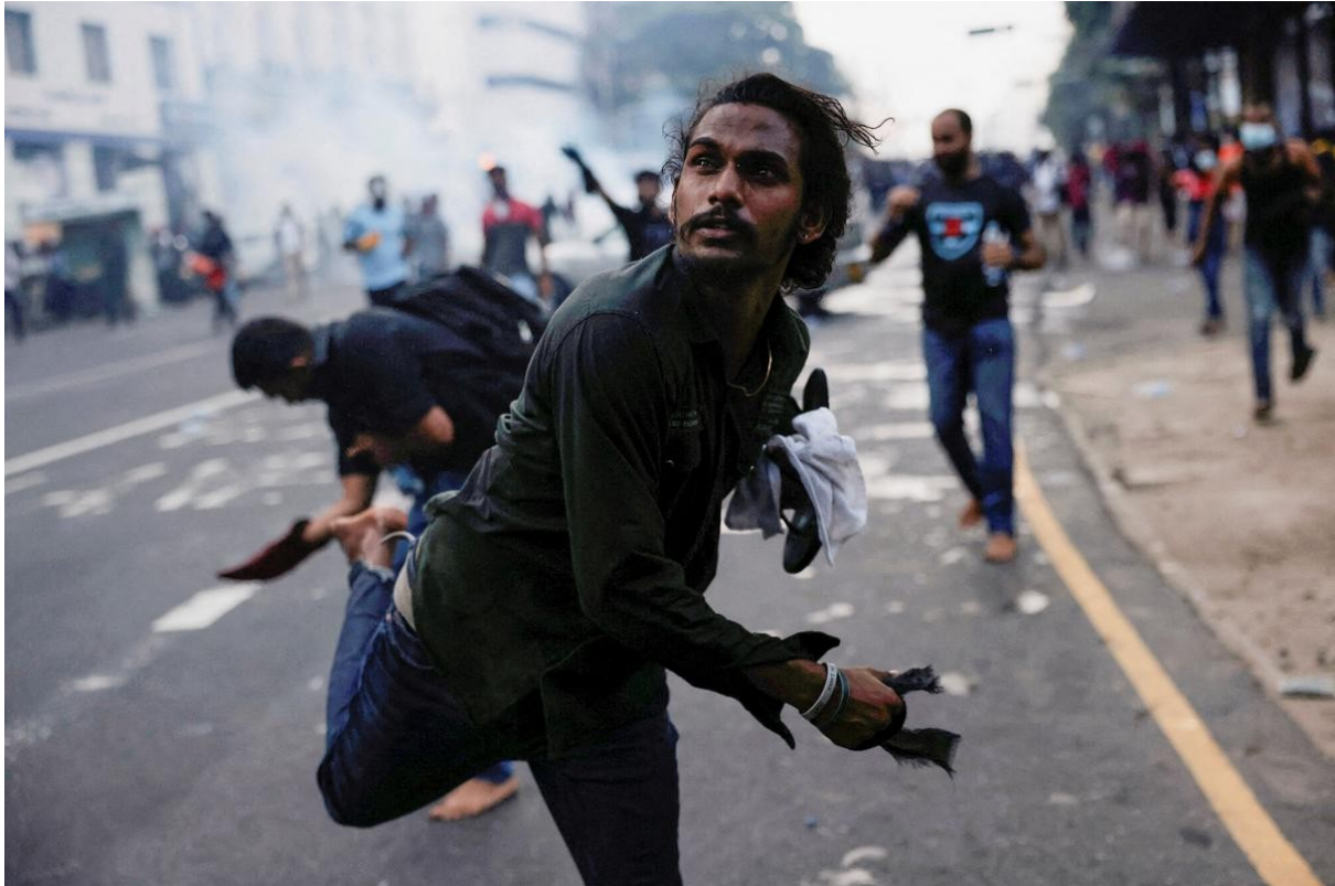
A demonstrator throws a tear gas grenade back towards the police