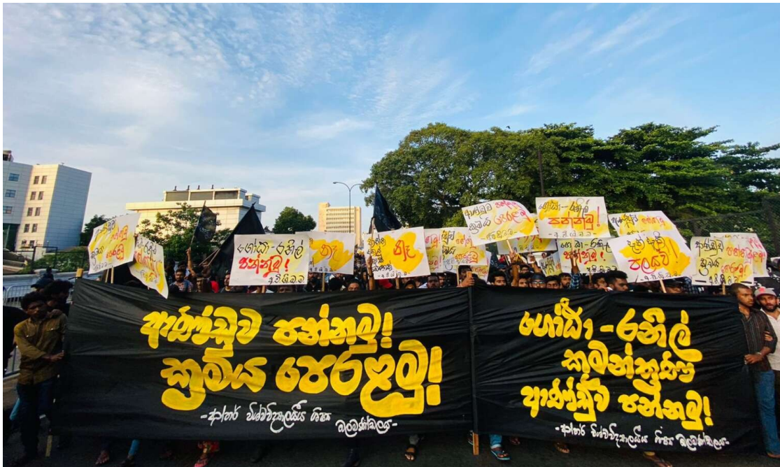
IUSF protesters carried large banners saying "Expel the government! Change the system!", "Chase away the Gota-Ranil conspiracy government."

On 8th of July, the Inter University Student Federation (IUSF) organised a protest demanding the resignation of the ruling government. This was organised to extend the support to the mass protest that was organised the next day by all protesters in GotaGoGama, occupy protest site. IUSF student activists marched from University Kelaniya premises to the GotaGoGama protest site on 8th of July and stayed overnight there and joined protests the next day. In this context, the Police went to the court seeking a restraining order against the student protest, which the court rejected.