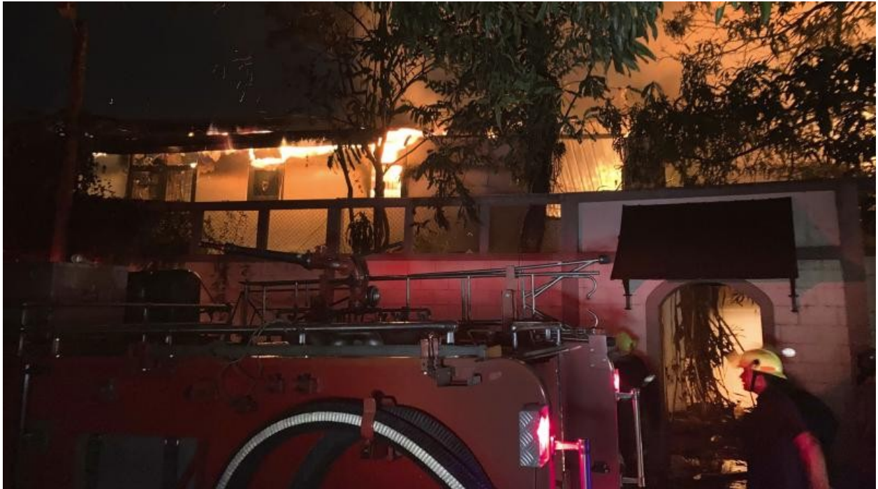
Firefighters try to douse a fire at the Sri Lankan prime minister Ranil Wickremesinghe's private residence, in Colombo, Sri Lanka, Saturday, July, 9, 2022.